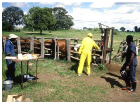
Disease control programme: cattle being tagged on a 'choice farm' in the mid-1990s.

By 1969 the Rhodesians, who had issued an illegal Unilateral Declaration of Independence (UDI) from Britain four years earlier, had stripped the country's blacks of all the best land. After World War II, British soldiers were given choice farms as a reward so that by the time independence was won in 1980, more than half the commercial farmland had been taken from Africans. Many black Zimbabweans bitterly remember when their families were forcibly removed from their ancestral land and dumped on arid, rocky land on the edges of the fertile central plateau.