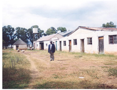
The struggle to restore the land: a farmer near the storage buildings at Occupation Post Farm.

those who died in the struggle to restore the land to deserving people died in vain. The government's preoccupation with paying the country's "odious debt" is robbing black people of their God-given right to the land. Now South Africa is caught up with "globalisation", which is compromising small-scale farming and food security and increasing unemployment. During apartheid, the mining industry had been very aggressive in recruiting mineworkers from the Eastern Cape. Now many of those men have been retrenched. They are unemployed and their health has been severely compromised. Our country is not going the way that we thought it would in terms of addressing the needs of the people. Capitalism has quite a different plan for people. Still, in their generosity of spirit, African people are "willing" to give the government time to recover from hundreds of years of oppression and severe underdevelopment.