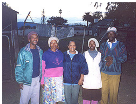
Working to acquire land first: KRDT's Executive Committee perseveres during difficult times.

One woman in Queenstown said to us, "What a pity – good land is being taken by foreigners and they are using it for game reserves, for tourism." So some of these farms are being sold to foreigners who are not even there all of the time. Also, at the Department of Land Affairs, there was no inventory of available farms so it was difficult to find them.