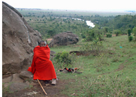
A young Maasai in Masai Mara, Kenya: the Maasai have lost many of their traditional land rights.

In 1988, the Moi Government also made an attempt to resettle the Ogieks. The government initiated a settlement scheme at Ndoinet in South and Western Mau in which the Kipsigis and the Ogieks were to be resettled. But the Ogieks refused to participate in this scheme arguing that it was their ancestral land and that they did not need to share it with the Kipsigis. The government nevertheless appeared determined to have the Kipsigis benefit from the land.