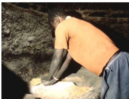
A Cameroonian grinds grain by hand: Secure traditional land tenure for cultivating food crops.

In a few cases, however, some consideration was given to indigenous people when creating nature reserves. Over three quarters of chiefs (78%) around the Banga Bakundu Forest Reserve said that, during the creation of the reserve, the colonial government of the time demarcated a large portion of land that had been shared by several communities and designated it as reserved. To replace it, the administration gave these communities access to and control over other land parcels for agriculture and the harvesting of forest resources, although without giving them title deeds. These alternative parcels of land put at the disposal of indigenous communities were referred to as "community forests". Discussions with respondents revealed that the traditional rulers of each village shared out the community forests among families. The head of each family (usually male) further shared the family land among the male children of the family. These male children had rights over the parcels of land given to them but had no land titles. A portion of the family land was usually left under the control of the head of the family. Female family members had access to family land but had no control over it. In other words, females could cultivate food crops on family land but could not dispose of the land; the reverse obtained for males. Moreover, females lost access to family land when they married.