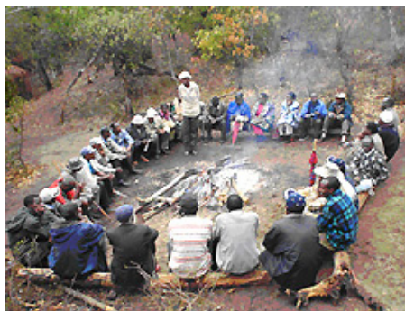
Ameru elders in Kenya plan how to protect the Gitunge sacred forest from encroachment.

Since Europeans began exploiting Africa centuries ago, the value of land to Africans and non-Africans alike has been determined partly by the worth of its natural resources. Over the centuries, the desire for agricultural products and valuable minerals led to violence, population displacement, landlessness and environmental degradation at the hands of colonialists. Though colonialism has ended, local and regional conflicts over the control of land still threaten the peace. In Kenya, the land problem has at times taken an ugly ethnic turn in which thousands have been killed