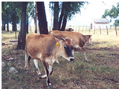
Jersey cows belonging to the KRDT project.