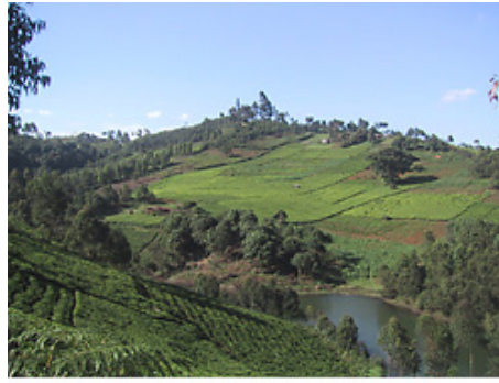
Trees cleared for tea farms in Kimotho, Kenya: land is not a problem shed like a snake's skin.

and forgotten. After forty three years of independence (achieved in 1963), landlessness continues to dominate political discourse among politicians who use it over and over again to gain popularity and power, creating a class of politicians who ultimately become masters of the double discourse of theory and practice in their in dealing with the issue. While on one side of this double discourse politicians openly condemn government failure to deal with the issue, on the other side they exacerbate the issue by giving land to their cronies in return for political support. This has made independent Kenya, especially during the Kenyatta and Moi regimes, contradict and bring shame upon what had been promised as independence for the country.