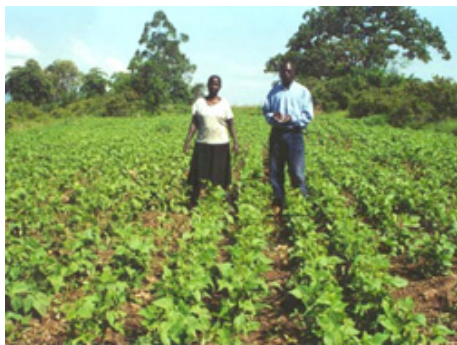
A Kenyan farm couple: title deeds for customary holdings have not solved many land problems.