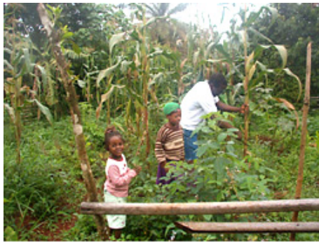
A family in Cameroon works on the harvest: Secure land tenure enables farming without fear.

In response to this situation, the indigenous people have engaged in dubious sales of protected land to immigrants. They seem to face no restrictions in conducting these transactions since the reserves belong to the government and no individual can claim to protect them. This state of affairs is further compounded by the absence of forest guards in the reserves plus the fact that the indigenous peoples do not have title deeds to lawfully controlled land. In the words of one non-native respondent, "We have nothing to rely on to determine the legality of land some natives purport to own. Frequently, no sooner do we buy land and commence cultivating, than we realize that we are cultivating protected land."