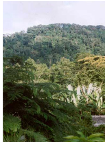
Cameroon forest: a poorly articulated land tenure system.

For its part, the Southern Bakundu Forest Reserve was created in 1937 as a native administrative forest reserve and approved following decree No. 22 of 25 April 1940 by the British Colonial Government (Ngwany, 2002). The forest reserve was created as private state property and classified as a forest (from which seedlings of rare and endangered plant species could be collected and planted elsewhere). The region consisted of distinctive flora and fauna with many additional endemic species.