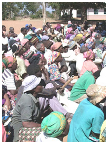
Is this the "third chimurenga"? In Chidobe, 590 families wait for food aid.

But, it was not what Mugabe had in mind. It would be tightly monitored and transparent. Within six weeks, the Zimbabweans had rejected the UNDP plan and chaos loomed. There is more than enough blame to go around. White farmers refused to accept widespread redistributions. Donors, long aware of the unrest in the rural areas, did not take an early lead. Britain and America who promised money didn't pressure Mugabe to take their funds early after independence. But the largest share of the blame rests with the government who ignored effective land reform. It only returned to the issue at election time when Mugabe thought ZANU-PF could make political capital out of land reform.