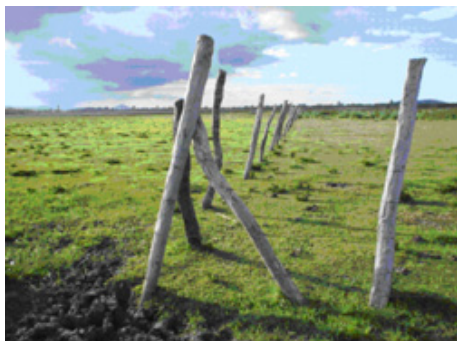
Boundary in Bututia dry lake bed in Meru, Kenya: people have been rendered effectively landless.