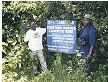
Sign for a farming and agroforestry improvement project in Cameroon: a need for sustainability.

Perhaps if land titles were given to every person who lawfully possesses land in this country, natural resources would be exploited in a sustainable manner. Also, given that the Cameroonian government is not succeeding in protecting most of its reserves, perhaps it is high time that it transformed some of them into community forests in accordance with the 1994 Cameroon Law on Forestry. Under this law, "community forest" is defined as a forest in a non-permanent forest area, the subject of a management agreement between a village community and the forestry authorities. The management of such forests is the task of the village community in question, funded or assisted technically by the forestry authorities. The agreement signed confers no property title, but it does confer a sustainable right of tenure and livelihood (The Courier, July-August 2002).