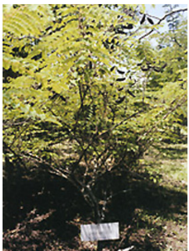
Protecting distinctive flora: pods harvested from this native tree species help regenerate Cameroon's forests.