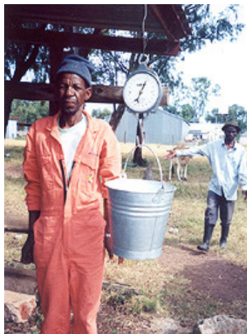
Hope, faith and dedication: KRDT farmers at milking time.