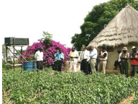
Small land holdings for most: a black farmer uses new drip irrigation system on his pepper field.

The 1992 Land Acquisition Act was fought over by the white farmers who said taking 7.2 million ha of their prime land was "irrational" and "illegal". There were disputes over land prices and the law was never seriously implemented. With its economy humming, the Mugabe government for about five years just ignored land redistribution and rural development. The white farmers meanwhile enjoyed unparalleled prosperity after independence. With peace and relative stability they built impressive irrigation systems that increased production. Their lifestyles were often lavish and many began to treat their black workers