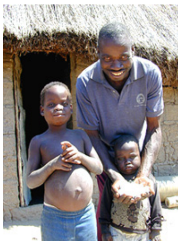
An Angolan man shows off the harvest: land belongs to a vast family - many are dead, a few living and many unborn.