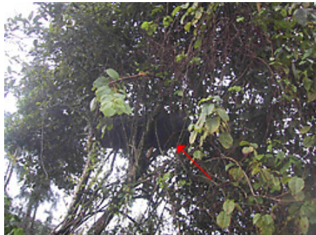
Beehive lodged in a tree in Kenya: Ogiek people depend on honey and other products of the forest.

The Kenyatta and Moi regimes have also come under criticism because decisions about distribution and redistribution of land were made in offices behind closed doors. There was little listening to how people who live close to the African soil express their sense of belonging and practise their values. Because the Kenyan Government relies on land laws and policies established under the British colonial government, many disadvantaged groups are denied ownership of their ancestral lands. A good example is the Ogieks who live in the Mau Forest in Rift Valley Province.