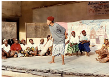
Nigerian woman performs in a drama competition on democracy and governance.