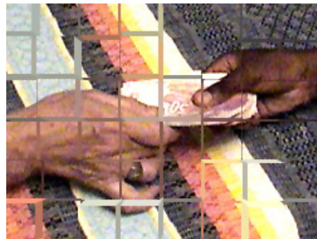
Blaming bribe takers recognises only half the problem. C. Hincks

At the very least, the Commission's attempt to take on the bribe givers, rather than simply blaming the bribe takers, might help shift public understanding and show that Africa is dogged by war, conflict and corruption not because of some curious continental incompetence, but because of how the West has preyed upon