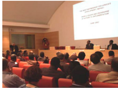
NEPAD meeting at the World Food Summit in June 2002.

The West has also significantly contributed to the vice. If the West was truly concerned with the fate of Africa, and committed to combating corruption which the Blair Commission identified as one of the root causes of its problems, then it seems only sensible to ask if enough has been done to help tackle this problem. For instance, despite expressing concern about the adverse effects of corruption in Africa and demanding that Africans adhere to certain standards of behaviour, none of the G8 governments has ratified the UN Convention Against Corruption. However, 29 countries – 15 of them African – have