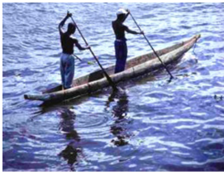
Fishermen on a pirogue on the Congo River: informality more a way of life than an economic strategy.

To what extent informal economies in Africa are based on processes that pre-date colonial contact and the rise of global capitalism is open for debate. It is enough to say that the focus on corruption as the main or even only process fueling their existence is problematic. But perhaps the ease with which western observers have associated the informal economy with the socio-political phenomenon of corruption is understandable given the Eurocentric viewpoint from which this understanding has been constructed.