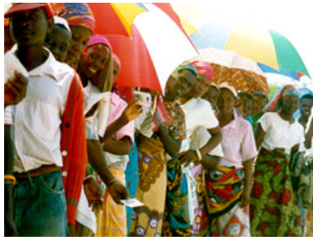
Queuing to vote in Mozambique: removing obstacles to civil and political rights is part of the AU Convention on Preventing and Combating Corruption.