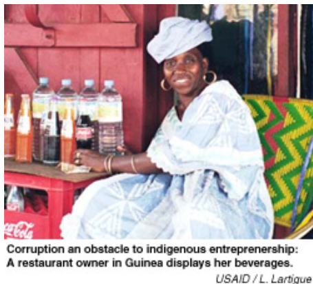
Corruption an obstacle to indigenous entrepreneurship: A restaurant owner in Guinea displays her beverages.

stability. According to John Githongo, a former anti-corruption czar in Kenya, "corruption—in particular grand corruption and looting of the kind that has tangible economic implications—is at the epicentre of the failure by many African countries to achieve economic objectives so finely articulated in their development plans." 1 In a report presented in September 2002, the African Union (AU) estimated that corruption costs African economies in excess of US$148 billion a year. Both direct and indirect costs of corruption not only represent 25 percent of Africa's GDP but also increase the cost of goods by as much as 20 percent. 2 This is how corruption has retarded development of the continent by undermining indigenous entrepreneurship and scaring away foreign investments.