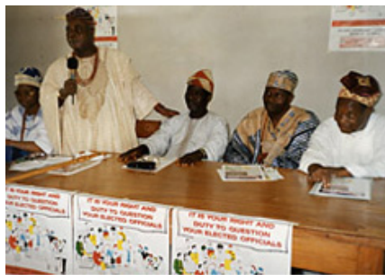
Participants at a Nigerian People's Forum to promote accountability in governance. Table posters say: "It is your right and duty to question your elected officials".

The United States Agency for International Development (USAID) defines corruption as the misuse of public funds for private gain; 3 while the World Bank defines it as "the abuse of public positions for private or sectional, material or status gain." 4 The major problem with these definitions is that corruption is not restricted to the public sector. Its practices also cut across the private sector to include profit and non-profit organizations. 5 In order to resolve these limitations, it is appropriate to define corruption as responsibility without accountability. In all social settings, whether private or public, wherever there is responsibility, accountability must be present to overcome the problem of corruption. Responsibility in this instance goes beyond finance to include democratic and organizational responsibility.