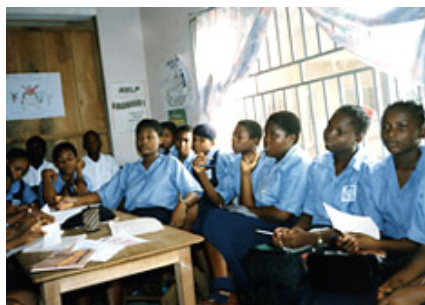
Peer educators in Nigeria help update materials on democracy and governance.

The government of the Fourth Republic took charge of a country which at various times under Generals Babangida and Abacha had been ranked as the first, second or third most corrupt country of those surveyed by Transparency International. In his swearing-in address as President of the Fourth Republic on April 29, 1999, Chief Olusegun Obasanjo stated his administration's commitment to fight corruption. He declared that there would be no sacred cows. Later, he sent a bill to the National Assembly: the bill was passed and the Independent Corrupt Practices and Other Related Offences Commission (ICPC) was established to administer the act. However, many national and international experts have since argued that the act and the commission are dormant. Moreover, Nigerians themselves do not believe that the ICPC is effective. 13