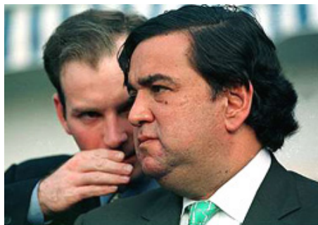
Curbing conflict and corruption or preying upon Africa's vulnerability? An aide advises Bill Richardson, former US ambassador to the UN, during a 1997 visit to Kinshasa.