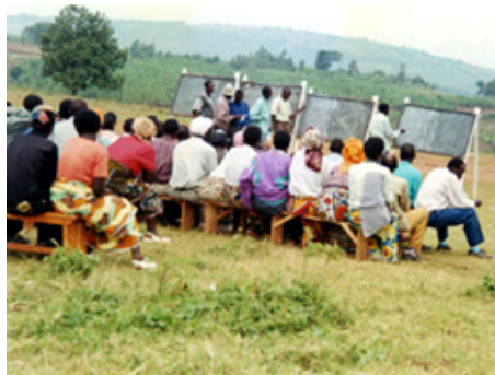
Grassroots transparency: counting the votes for a new judicial system in Rwanda.

Africa's people who nevertheless suffer from corruption and who must overcome it. The process of overcoming has been underway for years, beginning with democratization movements in the early 1990s. These were followed, throughout the 90s and into the new millennium, by an end to apartheid in South Africa, the end to military dictatorship in Nigeria, and an end to full-scale wars in the DRC, Angola, Sierra Leone, and Liberia.