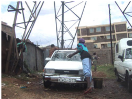
"Débrouillez-vous!": washing a car with water pilfered from a city council pipeline in Nairobi, Kenya.

In the documentary, Enron: The Smartest Guys in the Room , one scene shows a key Enron executive exhorting his employees to invest in more shares in the company. At this time, four months before the collapse of Enron, he had already begun to sell of all of his. At least Mobutu Sese Seko, the kleptocrat of kleptocrats, was upfront with his people. When they complained about corruption he exhorted them to help themselves ( Débrouillez-vous! ). "It was acceptable to steal a little so long as the theft remained within limits." (Michaela Wrong, In the Footsteps of Mr. Kurtz , 2000, p.147).