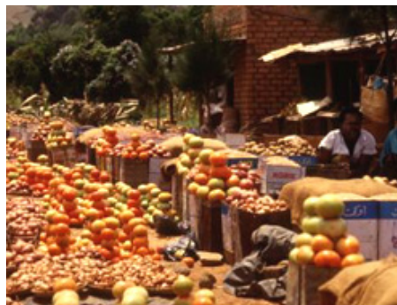
A roadside market near Mbarara, Uganda: some aspects of the informal economy predate colonialism.

Africa' debate. 1 This article will challenge the notion that corruption is the main factor fueling the persistence and growth of informal economies throughout Africa (Eiras, 2003). In doing so, it will assert that eliminating corruption would not eliminate informal economic activity. Furthermore, it will maintain that in places where externally driven capitalist (i.e., transnational corporate) penetration has so distanced local populations from domestic resources that any attempt to either eliminate or assimilate the informal economy would be counter-productive, even devastating, to the development process.