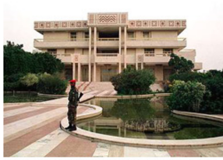
A soldier stands guard at Mobutu's palace in Gbadolite, Zaire: built with funds the West knew were being diverted.

Blumenthal predicted accurately that the Bank and IMF would reschedule the debts yet again, that Mobutu would dine again in the White House and the embezzlement of funds would continue to build Mobutu lavish houses in France, Belgium, Switzerland and Italy, as well as in Africa. But, the last pages of Blumenthal's reports are the most embarrassing for the foreign donors because they indicate how many well-placed "friends" and lobbyists Mobutu had in Western capitals who assured his ability to buy support. The names included top Belgian civil servants and journalists on Mobutu's payroll. Diamonds were sent to the wife of President Valerie Giscard d'Estaing of France in payment for debts.