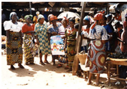
Nigerian women mobilise support for women's participation in local government. Their poster reads: "Together we can make better decisions: Include women in the traditional village council".

lasted less than three months before being overthrown by General Sani Abacha.