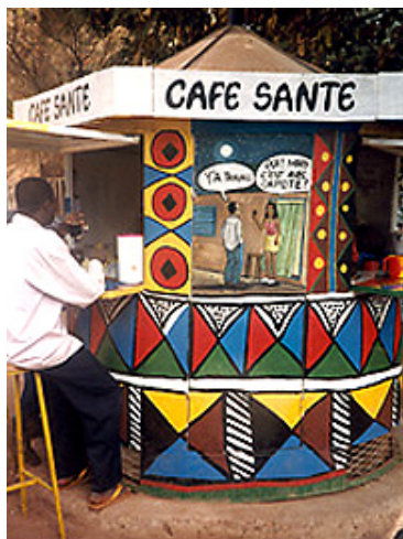
A kiosk in Ouagadougou, Burkina Faso, sells coffee and also promotes condom use in the sex trade: economies cannot be de-linked.

Second, any understanding of the informal economy in a given society can only be gained through an holistic inclusion of informal economic, political and socio-cultural processes. In other words, informal economic activities and processes should not be viewed as existing in isolation from a complex web of relations and activities that occur outside more formal processes and institutions.