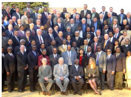
NEPAD Action Plan calls for strengthening of judiciaries: South African judges at a training workshop pose with President Thabo Mbeki (bottom row, second from right).

In the medium-term, the NEPAD plan calls for adoption by African states of relevant international conventions, standards, and best practices; permitting international legal assistance in anti-money laundering matters based on accepted international legal standards; establishment or strengthening of laws regulating the duties and responsibilities of participants in financial institutions; establishment and strengthening of laws relating to anti-corruption measures and prosecutorial capacities; adoption of national laws that provide for the criminalisation of money laundering and financing of terrorism; and improving co-operation within and without Africa to help recover funds illegally acquired through corruption and criminal activity that are subsequently deposited in foreign countries.