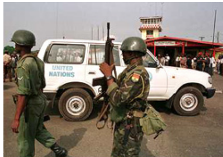
Ecomog soldiers in Liberia walk past one of the UN's "ubiquitous white vehicles" - another must-have perk.