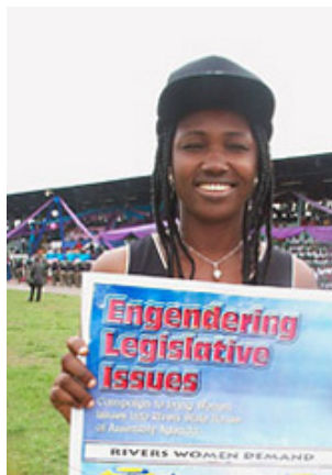
Inequality as a cause of corruption: a member of the Rivers State chapter of the International Federation of Women Lawyers advocates change.