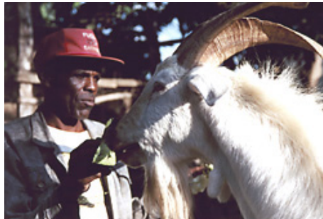
A fish farmer in Arusha, Tanzania, also 'rents' his goat for breeding purposes: impressive entrepreneurial skills.

The notion that there were important links between formal and informal economies led both the International Labour Organization (ILO) and the World Bank to encourage African states that were most aggressively attacking their informal economies, including the Kenya, to stop such attacks. Instead, they encouraged the government of Kenya and other governments in Africa to recognize the informal economy as the new and improved breed of emerging African entrepreneurship (Maundu, 1997). The Kenyan government, for example, was encouraged to intervene only so far as to reduce barriers to entry into the formal sector. In the late 80s, the World Bank combined both laissez faire and basic needs assistance as a part of its commitments to poverty alleviation and economic growth.