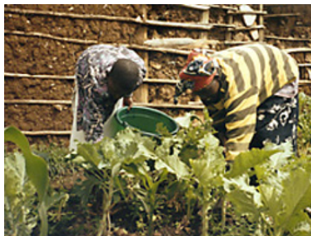
Two girls in Eldoret, Kenya, tend vegetables they will later sell to supplement their families' income: part of the web of social, political and cultural relations.

Just as it is important to understand the persistence and impact of pre-colonial economic phenomena it is also important to see these economic processes as part of a complex web of social, political and cultural relations that contribute to the formation, or lack thereof, of formal economic activity. A holistic understanding of informality sees the informal economy as but one component of a much larger 'informal sector'. Such an understanding provides insights into flaws in the way the informal economy is presently conceptualized. Most importantly, it reveals that the informal sector and, therefore, the informal economy also has very strong political, and socio-cultural dimensions with equally long histories (Polyani, 1944). These dimensions exist in their own right and also interact to shape African people's responses to processes such as economic exchange and corruption.