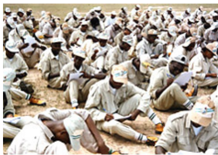
Members of Nigeria's National Youth Service Corps fill out a questionnaire on democracy and governance.

A third major initiative has been the decentralization of anti-corruption programmes to the state and local levels. The fiscal relations that existed among the three levels of government (federal, state and local) before the Fourth Republic led state and local governments to see anti-corruption campaigns as a federal matter. Now, however, there are anti-corruption committees like the Public Accounts Committee (PAC) in both state and national assemblies as well as anti-corruption units or departments in various ministries and in parastatals like the Nigerian Port Authority and Nigerian Freight Forwarders. Other anti-corruption units are found in police forces and customs. In Lagos State, for example, the police command has a monitoring unit that checks the activities of all police officers in the state. Some who have been found guilty of bribery or other corrupt practices have been dismissed.