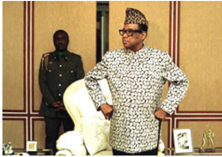
The West's "favourite puppet", Mobutu Sese Sekou, inherited King Leopold II's "magnificent African cake" - paid for with 10 million African lives.

Theft and corruption took over as kleptocracy became the norm. Zaire (now the Democratic Republic of Congo) is the classic example. It was there that King Leopold II of Belgium, who had appropriated the huge colony at the Berlin Conference of 1884-85, bragged that his personal domain was "a magnificent African cake." And Congo, as it was named before it was called Zaire, became synonymous with a succession of cruel and shameless European and American get-rich-quick schemes: from ivory, to tropical hardwoods, rubber and finally copper, cobalt, uranium, diamonds, gold and the rare tech-age