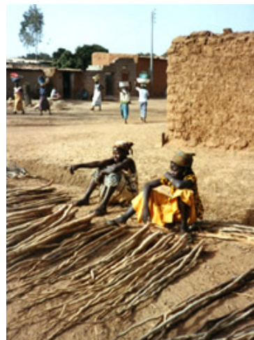
Working in the second economy: two girls in Burkina Faso sell wood fuel to urban dwellers.

Labels for what the Peruvian writer, De Soto, defined as "The people's spontaneous and creative response to the state's incapacity to satisfy [their] basic needs..." (quoted in MacGaffey, p.12) are as varied as the countries that have strong unofficial economies. In Ghana, it is kalabule ; in Uganda magendo , in Angola candong ; people in Zaire say simply, " Nous vivons mystérieusement " (MacGaffey, p.8).