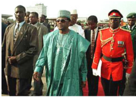
General Sani Abacha, former President of Nigeria (centre): a "kleptomaniac" kept and fed by the Western system.

kleptomaniacs in Africa. It was US pressure that induced the World Bank and the International Monetary Fund to offer aid to "their" man in Kinshasa during the third carving up of Africa during the Cold War. The relationship between Zaire and the US has been described by many former ambassadors as a "sick" one. Zaire, the wealthiest country in Africa in terms of resources, had its loans from the IMF rescheduled nine times before 1997 when Mobutu died leaving his country US$14.5 billion in debt and with no means to repay it. He left behind a legacy of civil war which is responsible for the deaths of more than